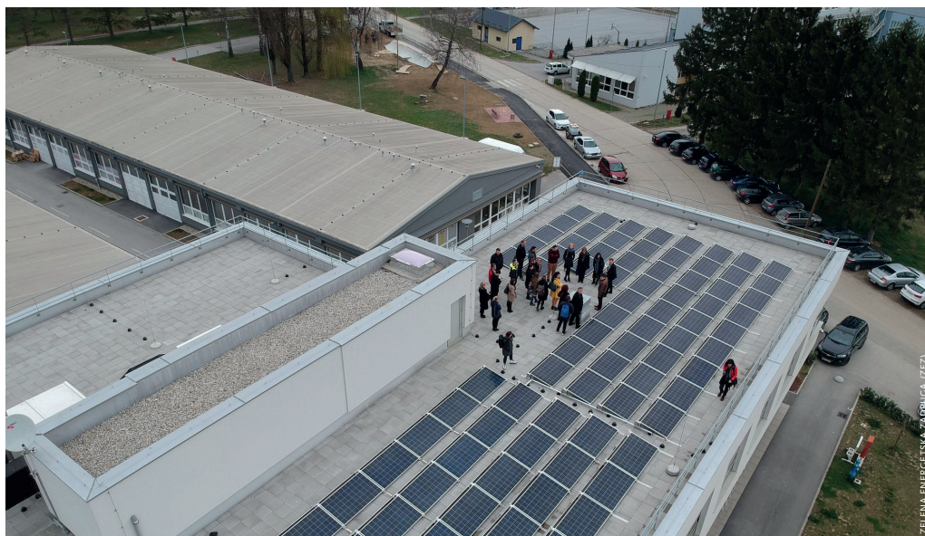
ZELENA ENERGETSKA ZADRUGA (ZEZ)