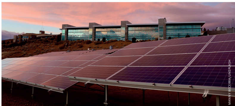
Exemplification of solar panels on non-residential infrastructure, encompassing open land and edifices, as facilitated by CORF.

The financial structure of CORF empowers local communities to invest in and benefit from green electricity production. The business plan is designed to maximise returns, engage a diverse range of stakeholders, and relies on the