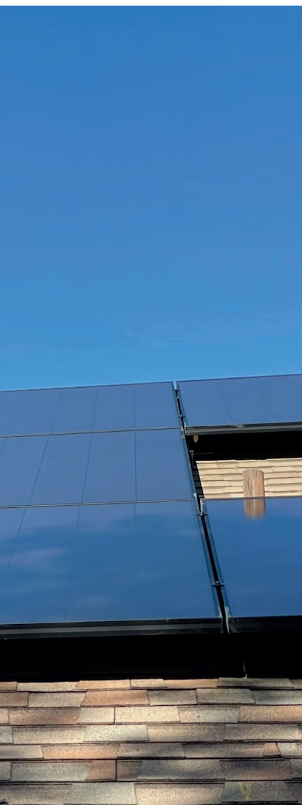
Illustration of a solar panel installation procedure

The Coöperatie Op Rozen Facilitair (Cooperative On-Roof Financing - CORF) case study is as an example of an innovative solution that addresses the challenges faced by energy cooperatives. CORF plays an important role in facilitating the formation of an energy cooperative, which is supported by the updated version of the RVT scheme, the Cooperative Energy Generation Subsidy Scheme (SCE) [2] [5]. The previous RVT was substituted with the SCE, which shares several features with the main SDE subsidy scheme for larger renewable energy and emission reduction projects. Consequently, the SCE does not include returning energy taxes [2]. The SCE scheme provides the cooperative with a guaranteed