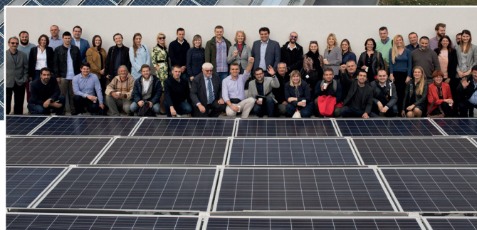
ZELENA ENERGETSKA ZADRUGA (ZEZ)