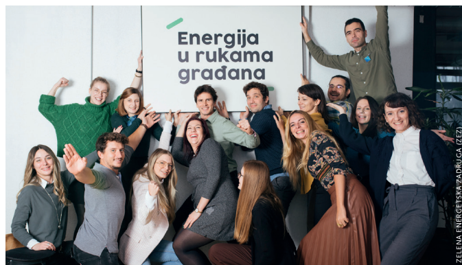
Zelena Energetska Zadruga (ZEZ) team

watts projected for roofs of public buildings in Zagreb, Cakovec and Križevci.